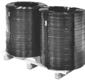
Ribbon wound skid